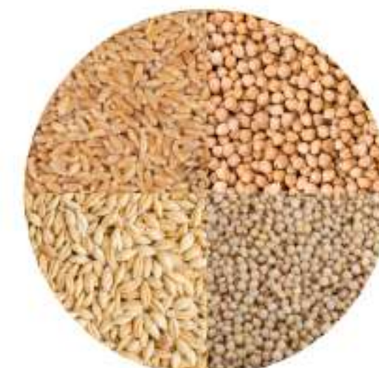
Multigrain (Wheat; chickpea; barley; sorghum)